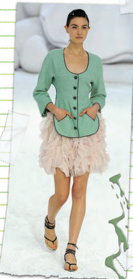
Resene Norway Chanel