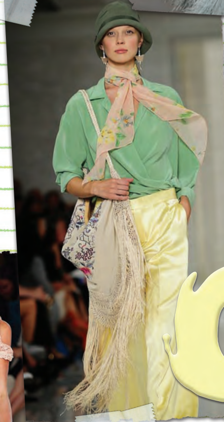
Resene Shalimar Ralph Lauren