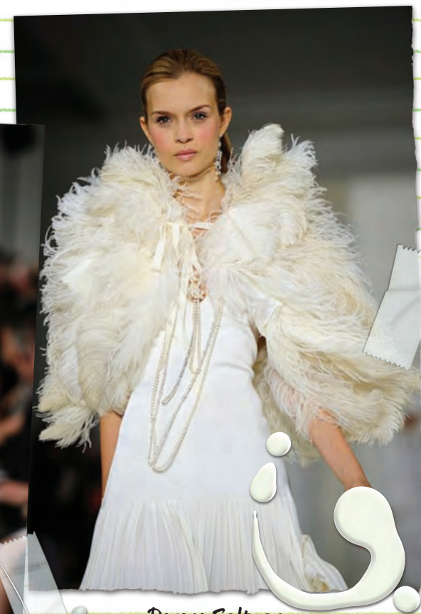
Resene Saltpan Ralph Lauren