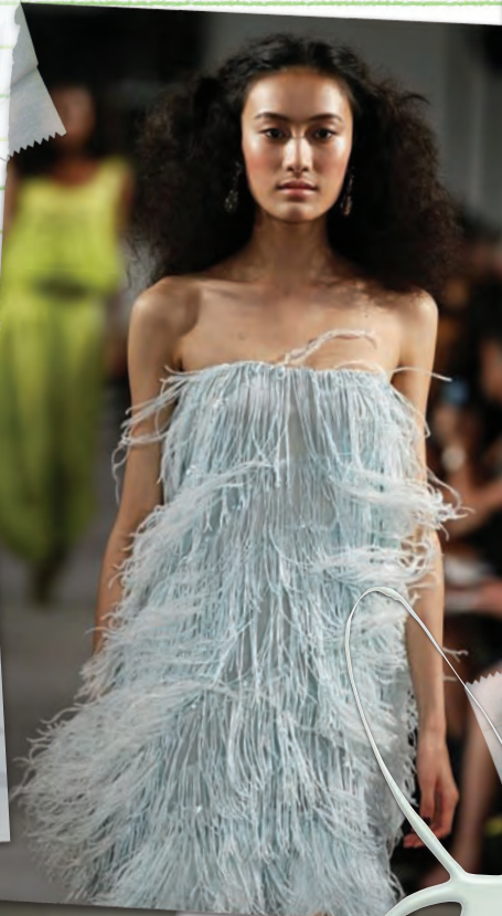
Resene Carefree Oscar Dela Renta