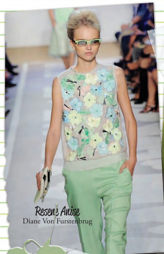
Resene Anise Diane Von Furstenbrug