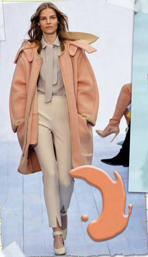
Resene Corvette Chloe