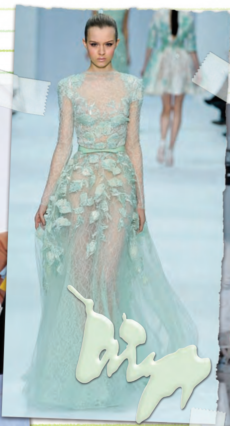
Resene Peppermint Elie Saab