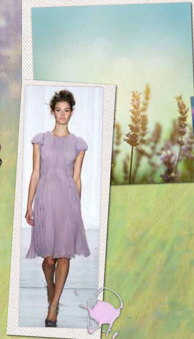
Resene Divine Zac Posen

Colours available from Resene ColorShops | www.resene.co.nz | 0800 737 363