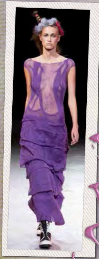
Resene Butterfly Yohji Yamamoto