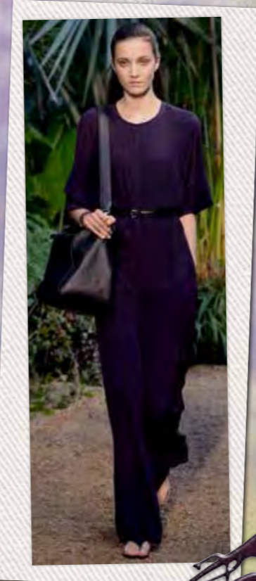
Resene Upstage Hermes