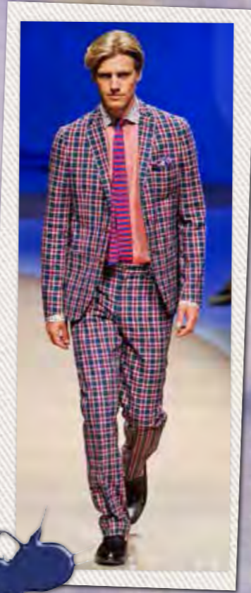
Resene Decadence Etro