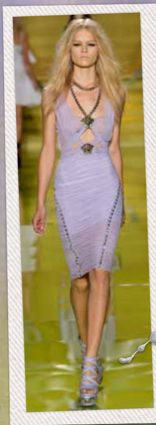
Resene Morepork Versace