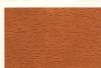
Heartwood™cw* wd WW0809