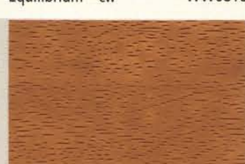
Natural™cw* wd WD026 (shown on Pine)