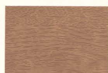
Limed Oak™cw WW13