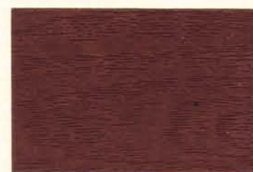
Jarrah Tree™cw^ wd WW0804