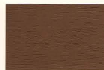
Nutmeg™cc cw* WW16