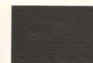
Touch Wood™cc cw* wd WD036