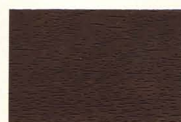
English Walnut™cc cw* wd WW8