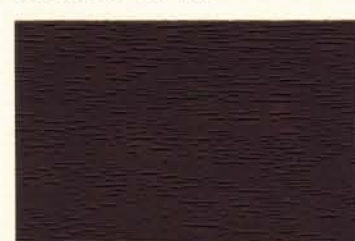
Tamarind™cc cw wd WD006