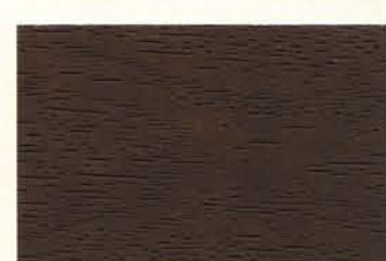
Limed Gum™cc cw wd WW12