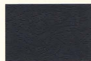
Woody Bay™cw wd WD038