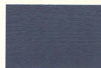
Skywater™cw wd WW0807