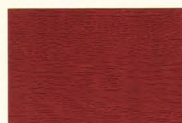
Japanese Maple™cw* wd WD017