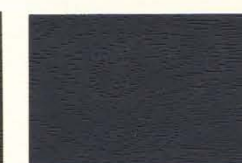
Woody Bay™cw wd WD038