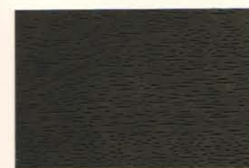
Canopy™cc cw* wd WW0819