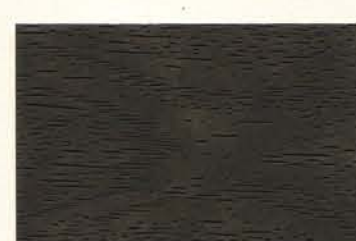
Banjul™cc cw* wd WD004