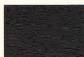
Crowshead™cc cw* wd WD001