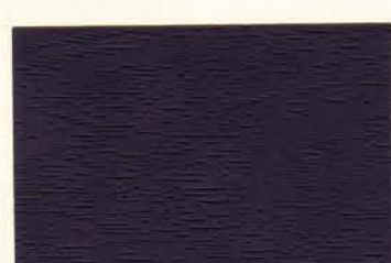
Jacaranda™cc cw wd WD019