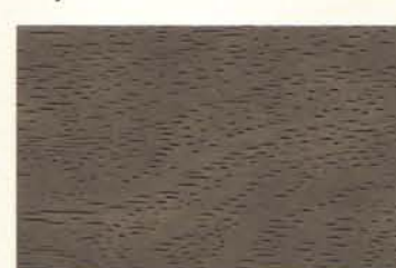
Iroko™cc cw* wd WD005