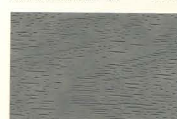
Limed Ash™cw WW11