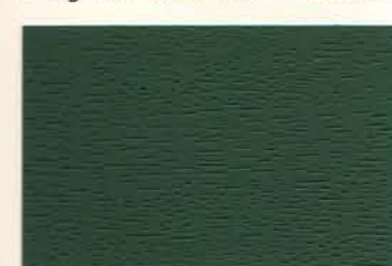
Earthsong™cc cw* wd WW0818