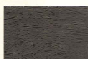
Tiri™cc cw* wd WW0811