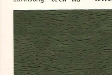
Grey Green™cc cw* wd WW9