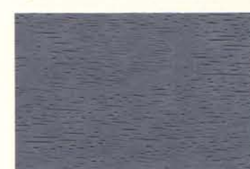
Silvered Grey™cw^ WW0802