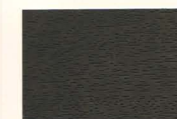
Canopy™cc cw* wd WW0819