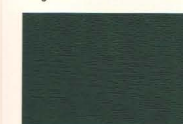
Evergreen™cc cw* wd WW0813