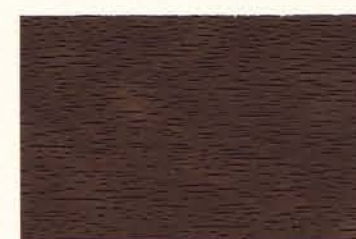
Bark™cc cw* wd WW0810