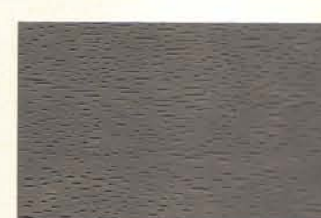
Smokey Ash™cc cw WW22