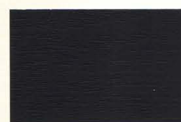
Pitch Black™cc cw* WD039