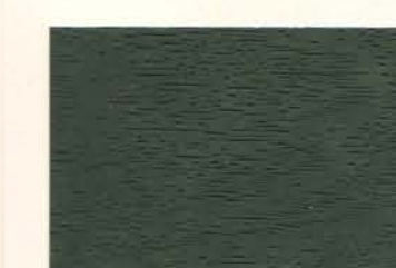
Rangitoto™cc cw* wd WD032