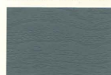
Pickled Bluewood™cw WW19