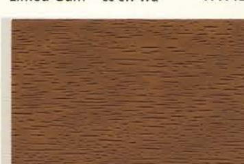
Natural™cw* wd WD026 (shown on Cedar)