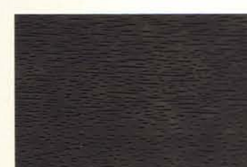
Sheer Black™cc cw^ wd WW0801