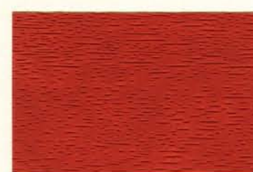
Totem Pole™cw* wd WD035