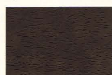
Treehouse™cc cw* wd WD037