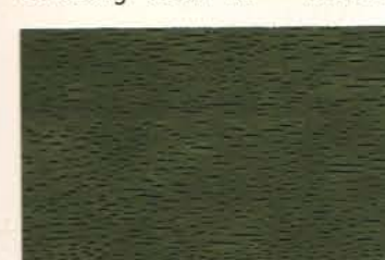
Grey Green™cc cw* wd WW9