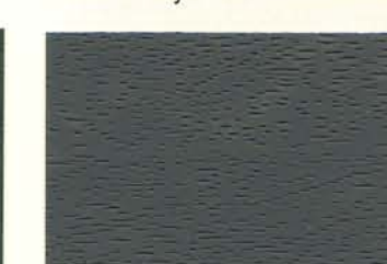
Bleached Cedar™cc cw WW400