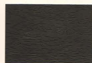
Touch Wood™cc cw* wd WD036