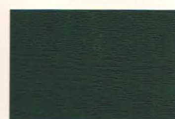
Evergreen™cc cw* wd WW0813