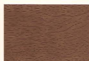
Pickled Bean™cc cw WW18