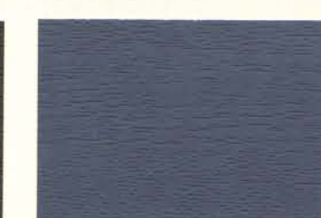
Skywater™cw wd WW0807