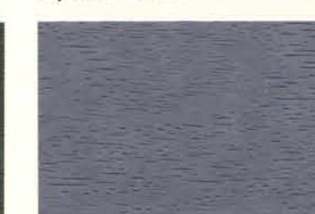
Silvered Grey™cw^ WW0802