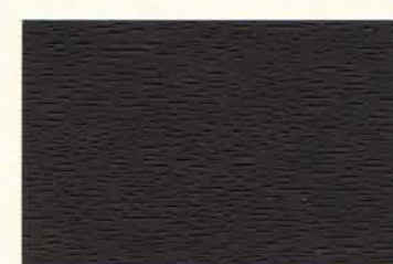
Shadow Match™cc cw* wd WW0808