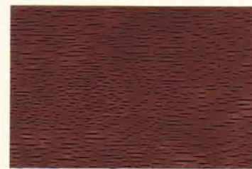
Cherrywood™cw* wd WD020

All colours except Natural are shown as they would appear on Pine. Colours will appear different on different timbers – always test your colour on an offcut before starting the main project.