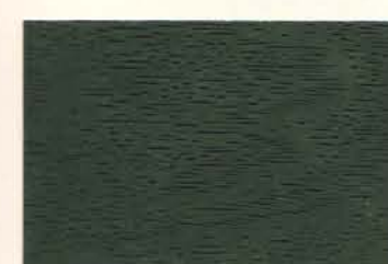
Rangitoto™cc cw* wd WD032