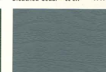
Pickled Bluewood™cw WW19