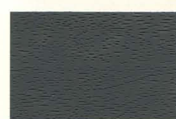
Bleached Cedar™cc cw WW400