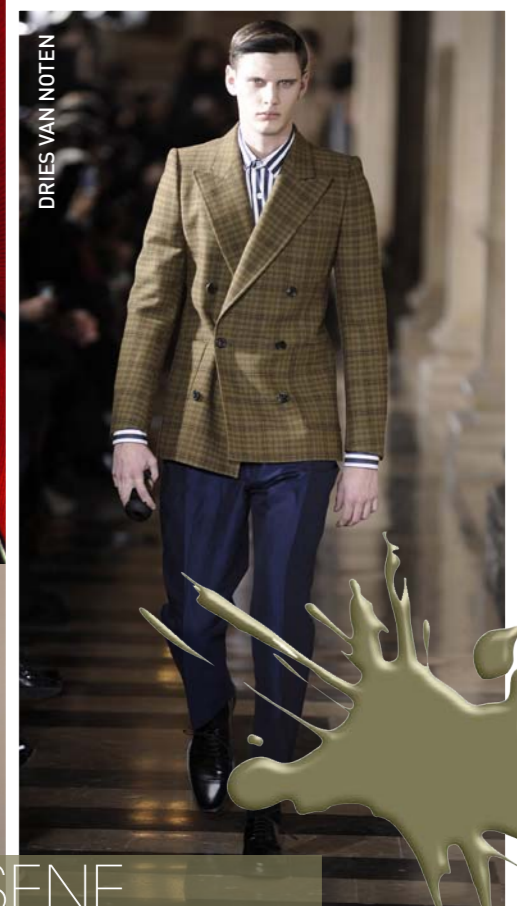
DRIES VAN NOTEN

Resene Fahrenheit is a rich temperate raisin red, mixed well with crimson tones and deep plum, referencing the deeper red tones found in the feathers and fur of popular wild game.