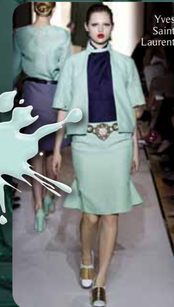
Yves Saint Laurent

For Marni's Spring/Summer 2012 collection, designer Consuelo Castiglioni presented a plethora of ladylike frocks, anchored by an organza underskirt. Oversized floral prints and soft pinks and lemons created a mood of youthful innocence, as did the liberal use of Resene Moxie, a bright emerald and shamrock green, sporty and fresh.