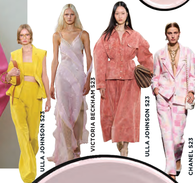
ULLA JOHNSON S23